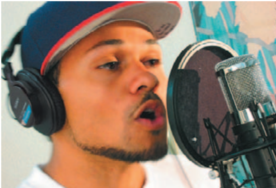
Diamond in the rough: Red Sox center fielder Coco Crisp lays down a rap track.